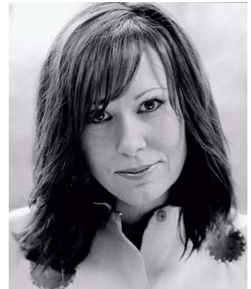
Featuring Award-Winning Recording Artist